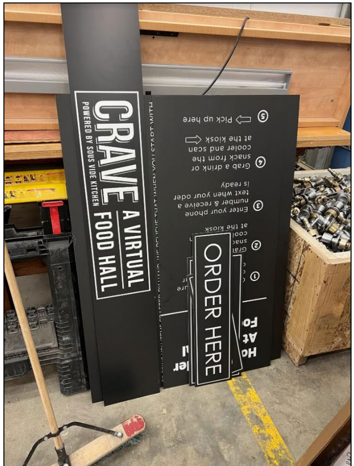
The Physical Plant sign shop has been working on new signage for the Arctic Health cafe, which is going to reopen soon as "GRAVE", a sous vide concept kitchen. Look for additional details in a future edition of this newsletter.