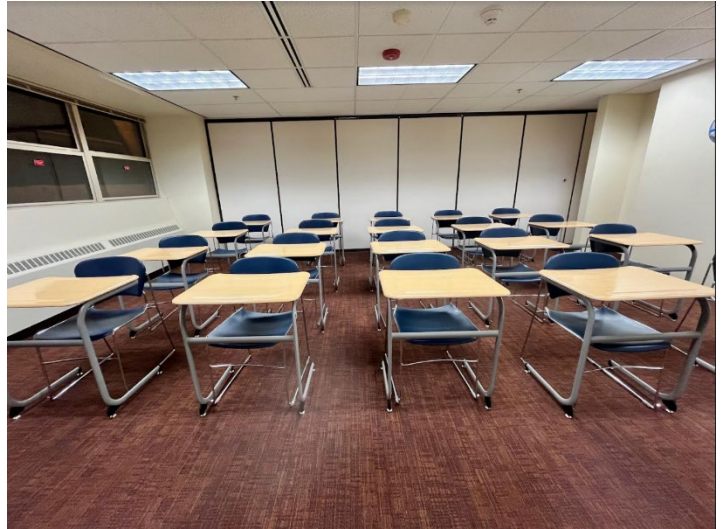
The FS Labor Shop did a great job replacing classroom furniture in Brooks 104A and 104B during the winter break. We've been upgrading general use classrooms all over campus, switching out the old "tablet arm chairs" that no one likes to these nice new single student desks.

If you have a great UAF facilities related photo that you would like to share with everyone, please send it to Nathan at njplatt@alaska.edu .