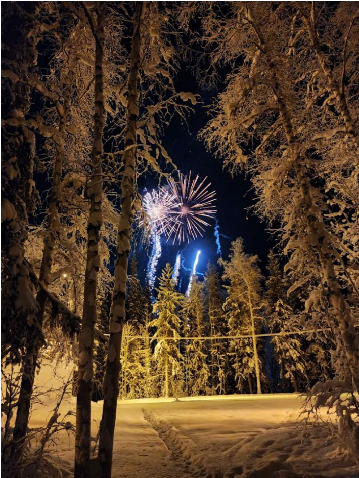
Fireworks on New Year's Eve as seen from the ski trails.