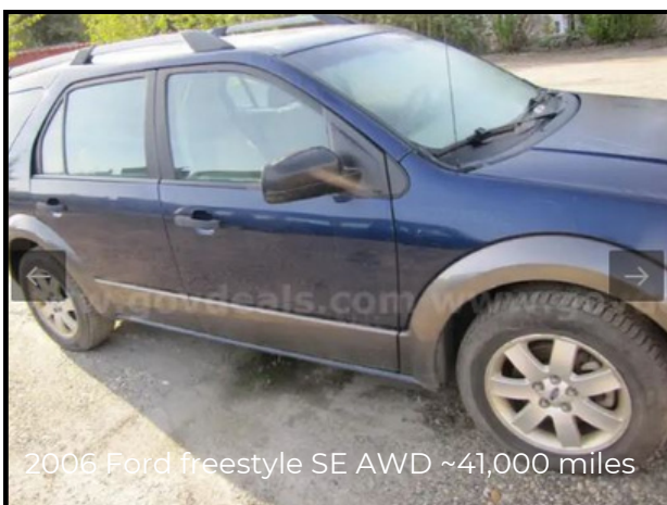
2006 Ford freestyle SE AWD ~41,000 miles