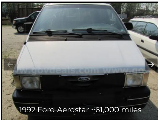
1992 Ford Aerostar ~61,000 miles