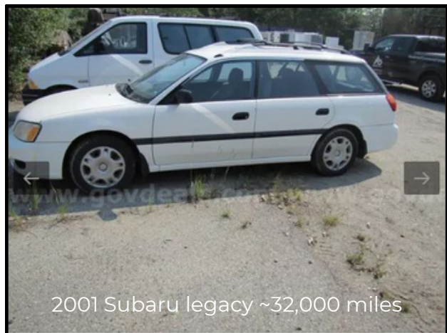
2001 Subaru legacy ~32,000 miles