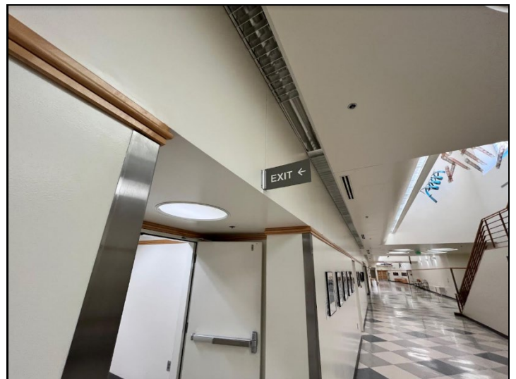
On January 19, Fairbanks experienced a mild earthquake (5.3 on the Richter Scale) that was close enough and large enough that everyone noticed! For the most part, the campus escaped any damage, except for this light cover in a hallway in Reichardt, which fell off during the quake.