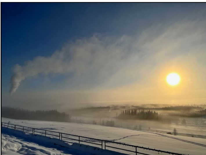
Ice fog settling over Fairbanks as seen from Butrovich last Friday.