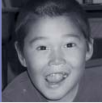
A student in Alaska's Lower Kuskokwim School District