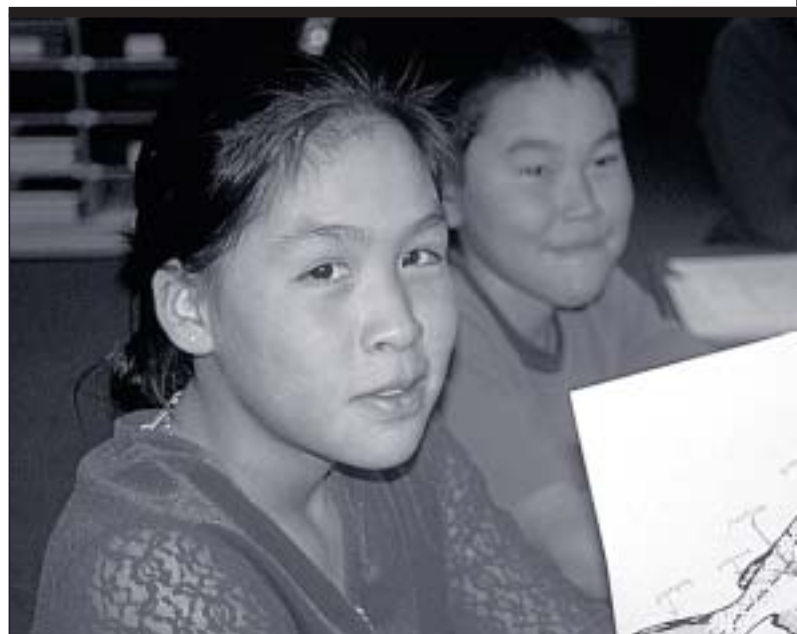
TOP: Head Start students perform a Tlingit song at a summit on Native education.

Elders say, "Fish as if you wouldn't catch any animals all winter. Then,