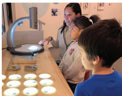
Whale Lab field trip participants look closely at krill using a microscope.