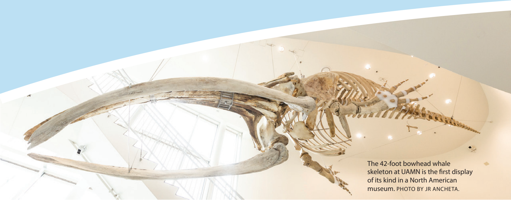
The 42-foot bowhead whale skeleton at UAMN is the first display of its kind in a North American museum.