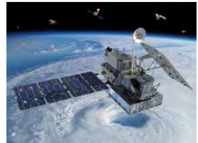
Global Precipitation Measurement mission, NASA/Goddard.

Scientists also use satellites to study Earth. A satellite is a machine launched into space to orbit Earth (or another object in space). There are many satellites looking down on Earth. They fly high in the sky, so they can see large areas of Earth at one time. They take pictures to send back to Earth.