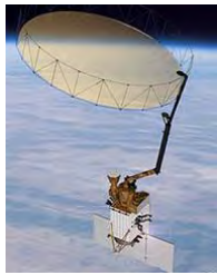
SMAP satellite.