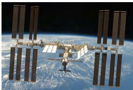
International Space Station. Image: NASA.

Right: Astronaut Christina Koch performs an experiment. Image: NASA.