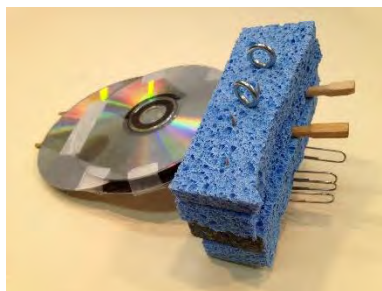
Model spacecraft examples.

Activity adapted from NASA SpacePlace: spaceplace.nasa.gov/build-a-spacecraft/en/