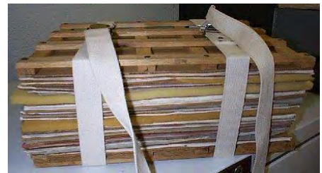
A plant press, University of Florida Herbarium. www.floridamuseum.ufl.edu/herbarium/voucher.htm