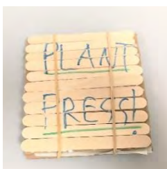
A homemade plant press.