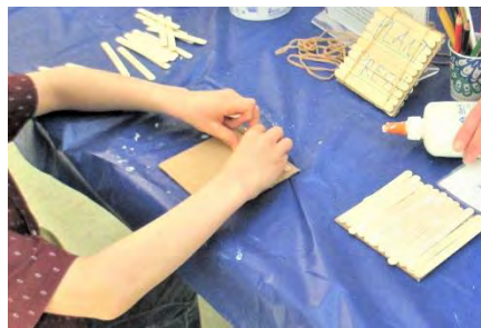
Student making a plant press.