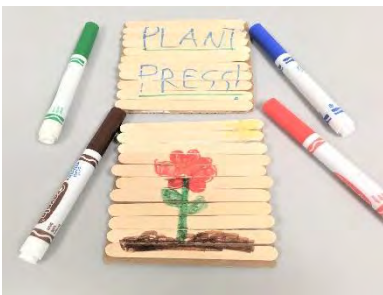
Decorating a plant press.