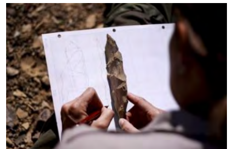
Sketching an artifact.