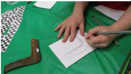
Sketching artifacts.