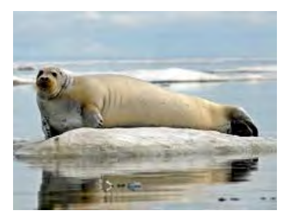
Bearded Seal.

Blubber is the thick layer of fat under the skin of marine mammals such as whales, seals, and walruses. For these animals, blubber has several uses, helping them survive in icy Arctic waters.