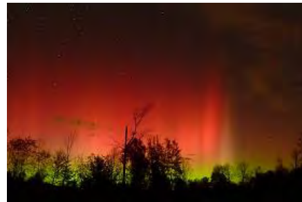
Joe Huff / NASA