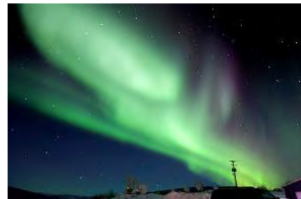
Terry Zaperach / NASA