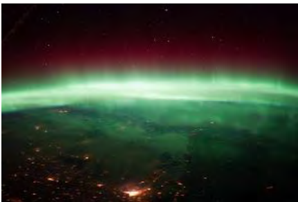
The aurora seen from the International Space Station.