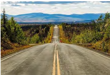
Left: Fairbanks in summer.

Weather is the combination of sunlight, wind, snow or rain, and temperature in one place at one time. These factors are constantly changing, so weather is changing all the time. Some places experience similar weather all year long, such as the cold temperatures in Antarctica. Other regions experience different weather conditions through the year. In interior Alaska, the weather ranges from hot and dry in summer to cold and snowy in winter.