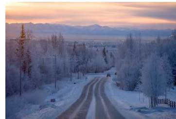
Right: Fairbanks in winter.

Weather is an important part of our lives. People often look outside to see what the weather is. Observing weather can give us clues that help us dress for the day, plan activities, or prepare for a storm. Meteorologists measure and study the weather and identify patterns over time. These patterns help them predict the weather.