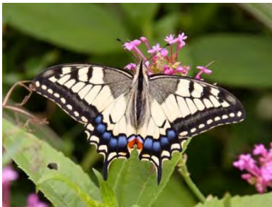
Tiger Swallowtail Butterfly