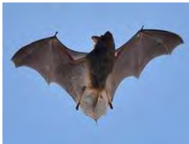
Little Brown Bat