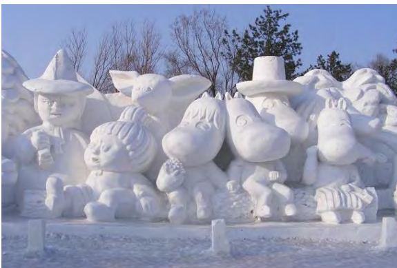
Moomins in snow, Harbin International Ice and Snow Sculpture Festival.

Snow carvings are made from blocks of densely packed snow. Snow carvers use some of the same saws and chisels as ice sculptors, as well as tools to give the snow different textures. The largest snow carving festival in the world takes place every year in Harbin, China.