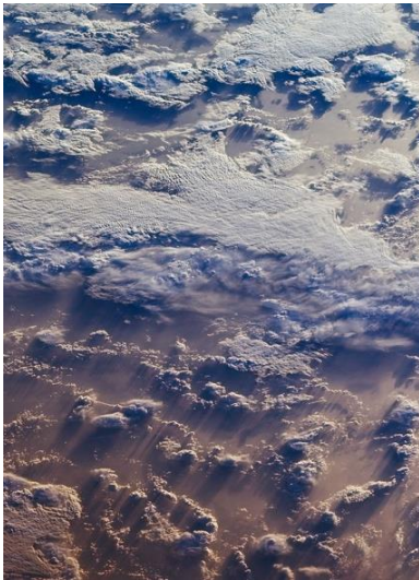
Clouds over the southern Indian Ocean.

There are many different kinds of clouds. On a hot sunny day, water rises to make cumulus clouds. Cumulus clouds often take interesting shapes. On sunny days, cumulus clouds don't usually bring rain.