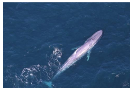
Blue whale.

The largest animal in the world, the adult blue whale, eats several million krill every day. The biggest animals on the planet depend on the tiniest animals to survive!