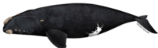
North Pacific right whale ( Eubalaena japonica )