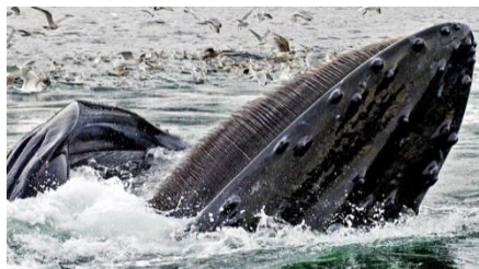
Humpback whale feeding.

Some whales don't have teeth! They feed by filtering the water and catching small prey with bony plates, called baleen , in their mouths. Their favorite food is tiny shrimp-like animals called krill, but they also eat copepods (tiny crustaceans) and small fish.