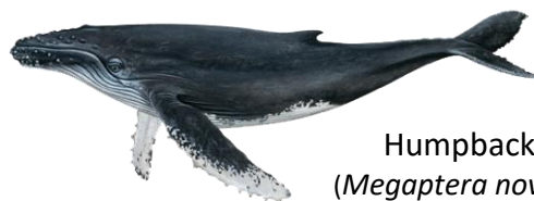
Humpback whale ( Megaptera novaeangliae )