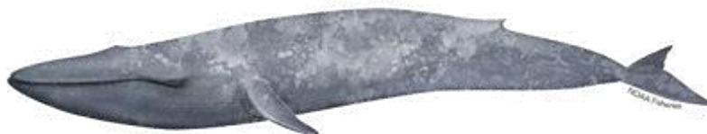
Blue whale ( Balaenoptera musculus )

Like many marine mammals, whales communicate through sound, which travels well in water. Some whale species are known for their elaborate song patterns. Whales of the same species can have many different songs!