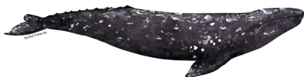
Gray whale ( Eschrichtius robustus )

Many species of baleen whales live or migrate in Alaska waters, including bowhead whales, grey whales, humpback whales, North Pacific right whales, and blue whales. Note: Images are not to scale. All images from NOAA.