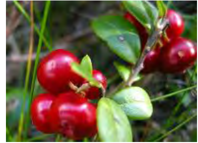
Lowbush Cranberry [Lingonberry] ( Vaccinium vitis-idaea )