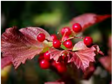
Highbush Cranberry ( Viburnum edule )