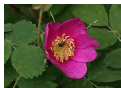
Rosehip [Prickly Rose] ( Rosa acicularis )