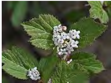
Highbush Cranberry ( Viburnum edule )