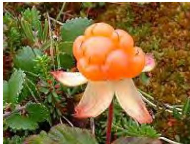
Cloudberry [Salmonberry] ( Rubus chamaemorus )