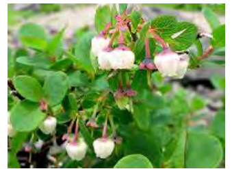
Flowers from a bog blueberry plant ( Vaccinium uliginosum ).

Berries are only ripe for a short time each year. For the rest of the year, you can identify a berry plant by its leaves and flowers. Their shape, size, and color are all clues to what kind of plant it is.