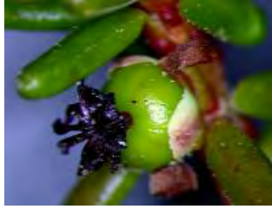
Crowberry ( Empetrum nigrum )