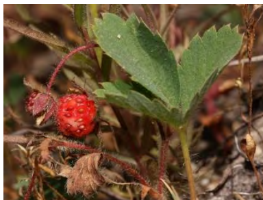
Wild Strawberry ( Fragaria virginiana )