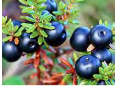
Crowberry ( Empetrum nigrum )