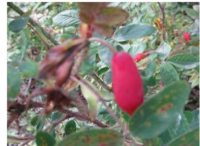
Rosehip [Prickly Rose] ( Rosa acicularis )