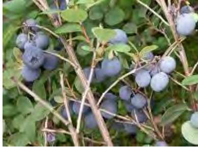
Bog Blueberry ( Vaccinium uliginosum )