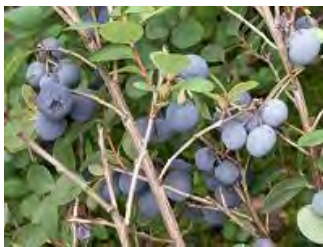
Ripe bog blueberries ( Vaccinium uliginosum ).

To adapt the game for younger children, print two copies of the berry matching cards, leaving out the flower cards. Instead of matching the berry to its flower, match the identical berry pictures.