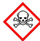
Baneberry ( Actaea rubra ) POISONOUS!