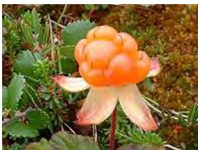
Cloudberry [Salmonberry] ( Rubus chamaemorus )