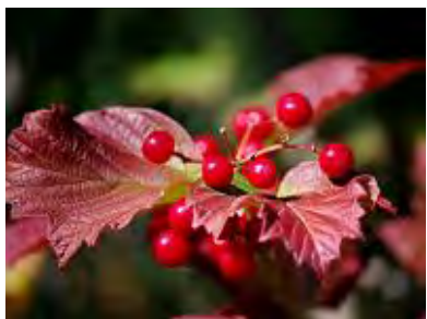
Highbush Cranberry ( Viburnum edule )