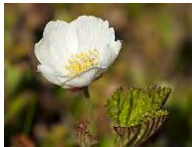
Cloudberry [Salmonberry] ( Rubus chamaemorus )