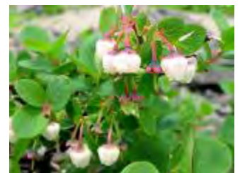
Flowers from a bog blueberry plant ( Vaccinium uliginosum ).

Berries are only ripe for a short time each year. For the rest of the year, you can identify a berry plant by its leaves and flowers. Their shape, size, and color are all clues to what kind of plant it is.