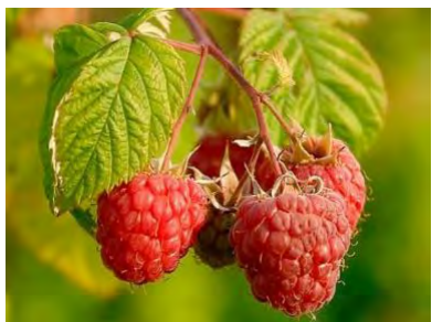
Red Raspberry ( Rubus idaeus )