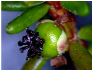
Crowberry ( Empetrum nigrum )