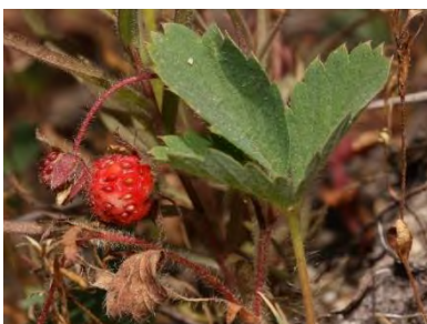
Wild Strawberry ( Fragaria virginiana )