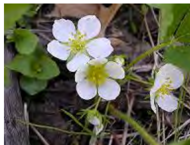
Wild Strawberry ( Fragaria virginiana )