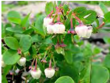
Bog Blueberry ( Vaccinium uliginosum )