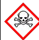
Baneberry ( Actaea rubra ) POISONOUS!