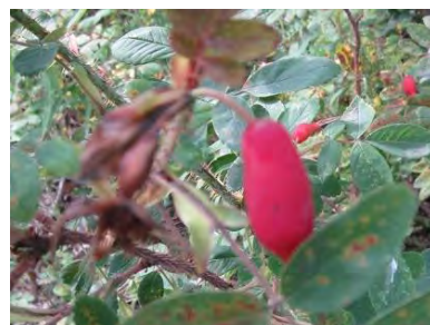
Rosehip [Prickly Rose] ( Rosa acicularis )