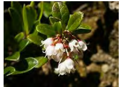
Lowbush Cranberry [Lingonberry] ( Vaccinium vitis-idaea )