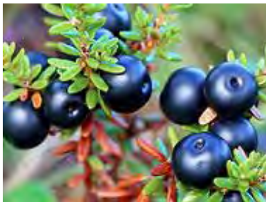
Crowberry ( Empetrum nigrum )