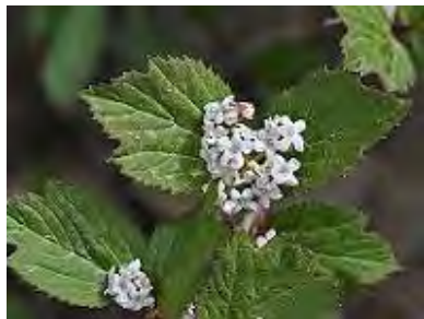
Highbush Cranberry ( Viburnum edule )