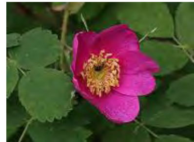
Rosehip [Prickly Rose] ( Rosa acicularis )