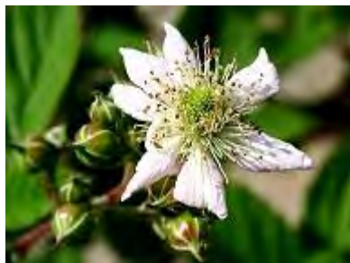
Red Raspberry ( Rubus idaeus )