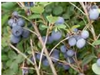
Ripe bog blueberries ( Vaccinium uliginosum ).

To adapt the game for younger children, use two copies of the berry matching cards, leaving out the flower cards. Instead of matching the berry to its flower, match the identical berry pictures.