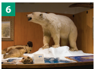
Marine mammals in the Western Arctic Coast Gallery.