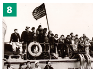
World War II Aleut evacuation exhibit in the Southwest Gallery.