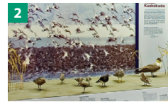
Birds in the Southcentral Gallery with a map illustrating their migration routes.