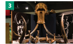
Mammoth and mastodon bones in the Pleistocene exhibit.