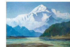
Historical paintings in the Alaska Classics Gallery.