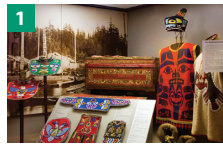
Tlingit clothing and regalia in the Southeast Gallery.