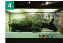
Blue Babe in the Interior Gallery.