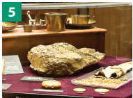
Alaska's largest public display of gold in the Interior Gallery.