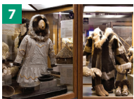
Eskimo clothing in the Western Arctic Coast Gallery.