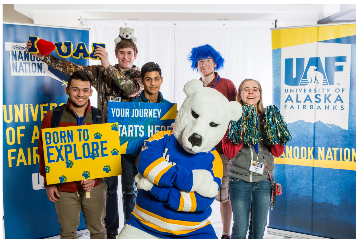
Future UAF students and family members pose with the Nanook mascot during Inside Out. 2016, UAF Photographer.

December 1: Subscribe to the Nanook Navigator & Student Success listerv