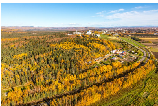
Aerial photo of the Fairbanks campus. UAF Photographer: Todd Paris, 2014