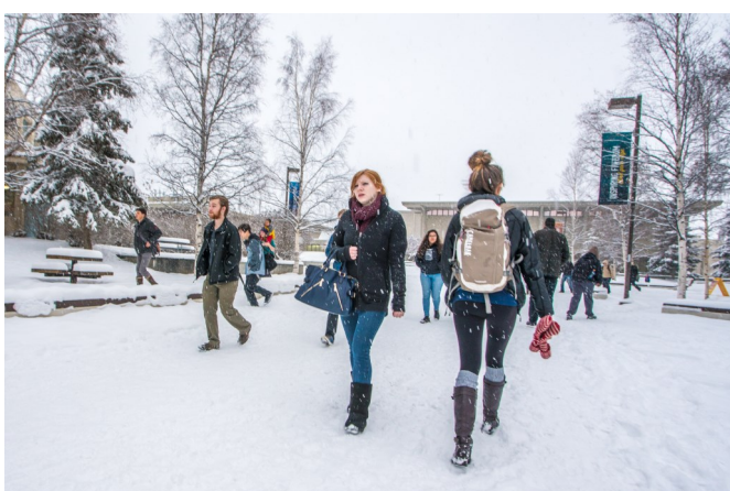
Students make their way across campus on a snowy November morning.