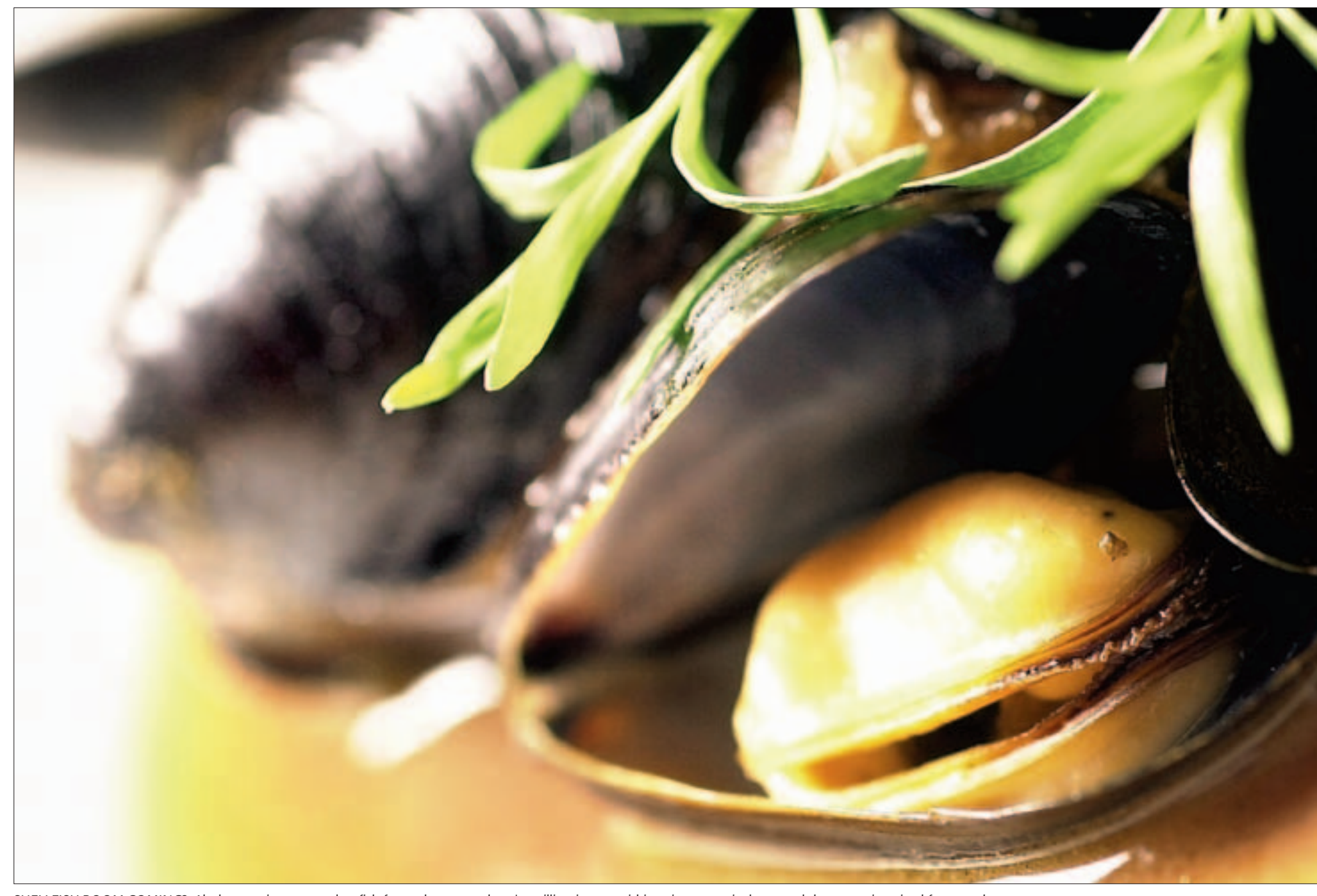
SHELLFISH BOOM COMING?: Alaska remains opposed to fish farms, but more than $1 million in state aid is going to mariculture, and the sector is poised for growth.