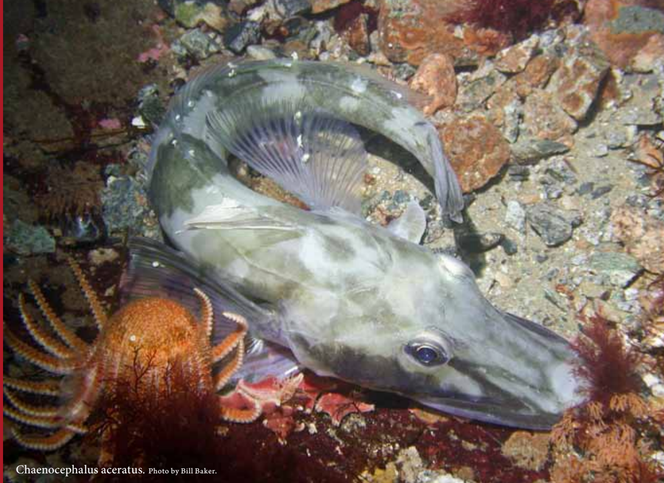
Chaenocephalus aceratus .

“They don’t taste like much of anything. They need lots of butter and garlic!” says O’Brien.