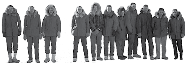
Barrow expedition image.

Leslie: How did a Southern boy from Louisiana end up at UAF?