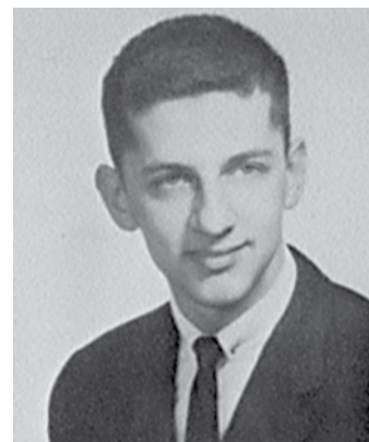
Photo from 1963 Deneff yearbook.