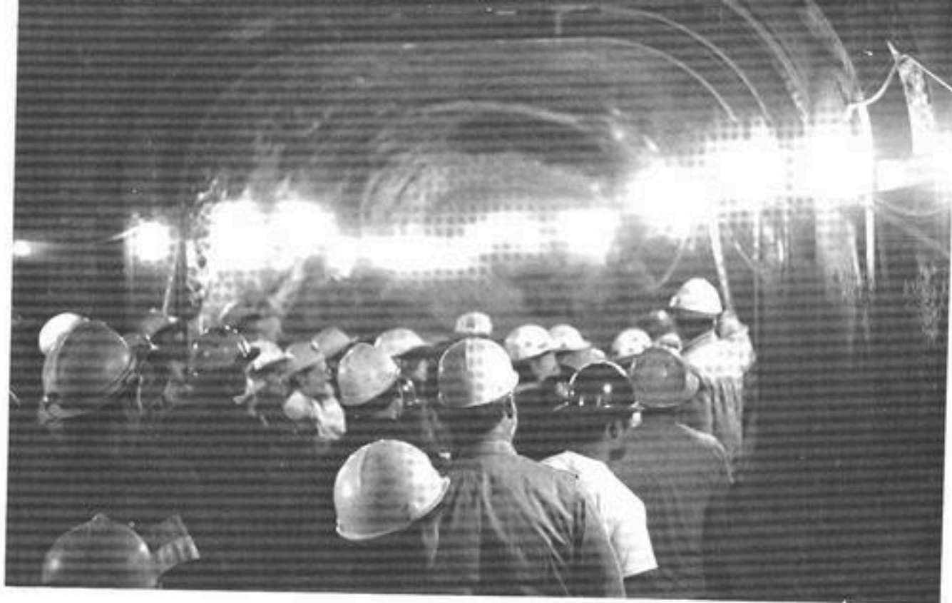
RAHI field trip to the UAF Permafrost Tunnel

...There was dust everywhere you looked. If you spoke too long, you would get dust in your mouth. Yep, it was that bad!!