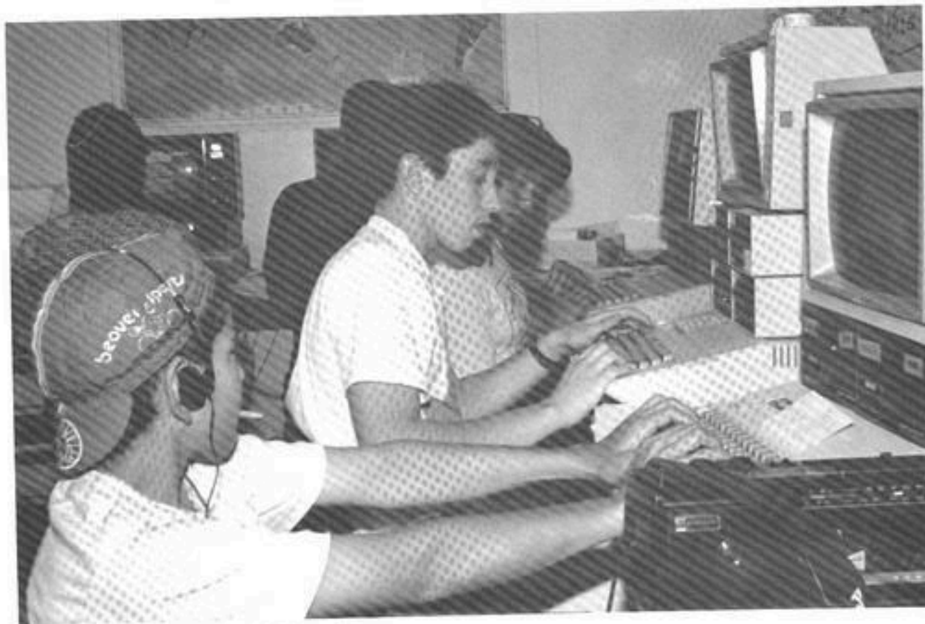
Word-processing laboratory at RAHI, in full use.

When I finally reach my destination, I replace all the old flowers with new Forget-Me-Nots that I had picked on my way there, to make the resting places look nice again. Michele Schaeffer