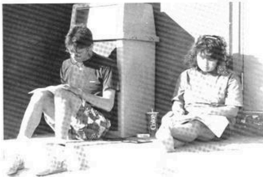
Togetherness on the steps of McIntosh Hall.

... She really liked animals. She had a bunch of chickens and each of them was named. She had two cats, Princess and Nubbins, which she loved dearly. Every night she'd call for the cats in her high-pitched voice, "Here kitty, kitty, kitty, kitty..." and at night we used to sit down on the deck and listen to the bullfrog, Charlie, and watch the family of rats going from tree to tree, until they reached the fig tree to eat.... Anon.