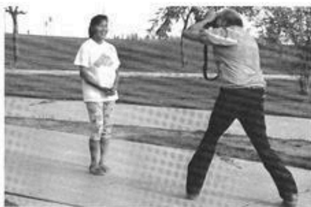
A portrait-taker in action. The joys of working on the Yearbook. Note results at left.