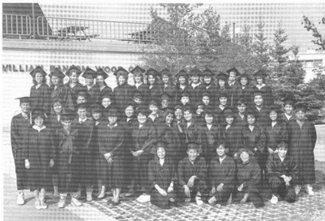
The RAHI Class of 1990 in Graduation regalia.