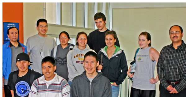
RAHI '08 Alyeska Petroleum Eng. Students

Between 1983 and 2008, over 1200 students have attended the RAHI program.