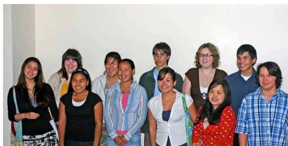
RAHI '08 Wells Fargo Business students

Let RAHI change your life and help you succeed in college. Apply today. See our website < www.uaf.edu/rahi/ > to download an application, see a school counselor, or call or email us for further information: 1-800-478-6886, < fyrachi@uaf.edu >