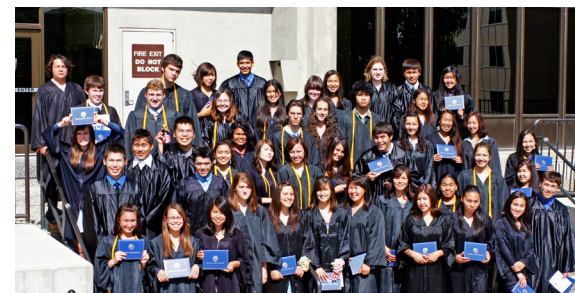
RAHI Class of 2008