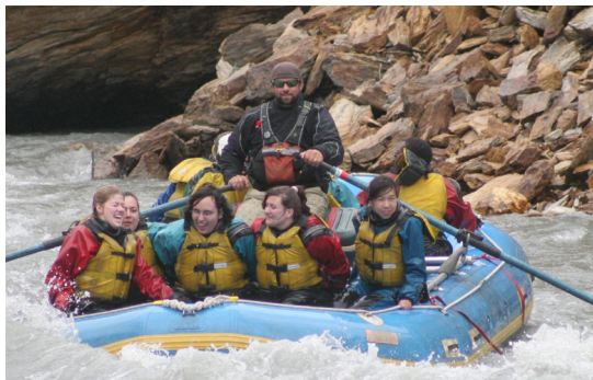
RAHI '09 rafting at Denali

Let RAHI change your life and help you succeed in college. Apply today. See our website < www.uaf.edu/rahi/ > to download an application, see a school counselor, or call or email us for further information: 1-800-478-6886, < fyrahi@uaf.edu >