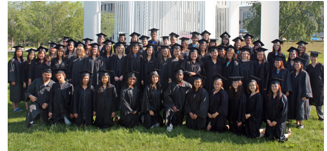
RAHI Class of 2009