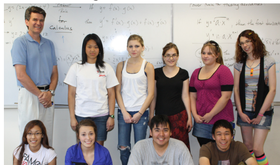
RAHI '09 Math class

Between 1983 and 2009, over 1250 students have attended the RAHI program.