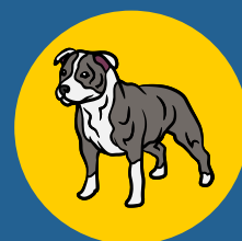
American Pit Bull Terrier