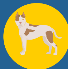
American/ Staffordshire Terrier