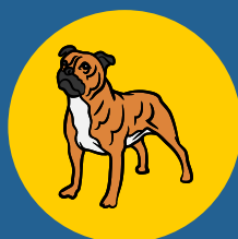
Staffordshire Bull Terrier