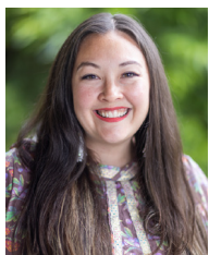
Master of Ceremonies